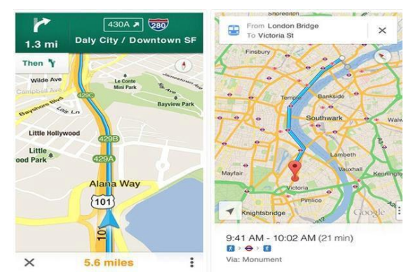
Fig2: Google Maps Navigation.